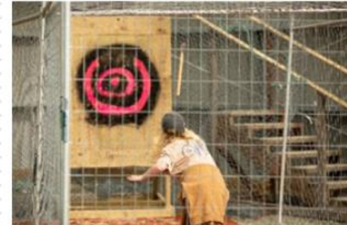
WEST WALL OYSTER SHED

Setup: Three throwing lanes, target board with line for Rangatahi to stand by. All encaged, sides, ceiling and entrance, with a closing and open fence entrance, insulation on the ground near the target board to reduce sound. Two - three people required at all times. One - two on the lanes and one controlling the crowd and queues.